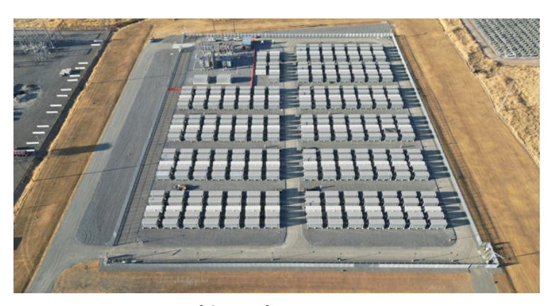
Southern California Energy Storage